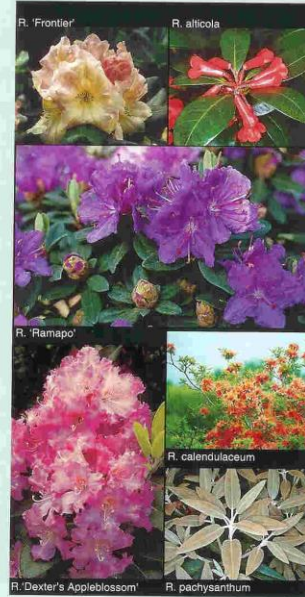
R. 'Frontier' R. 'allicola' R. 'Ramapo' R. 'Dexter's Appleblossom' R. 'calendulaceum' R. 'pachysanthum'