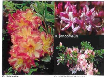
R. 'Naselle' R. 'Hampton Beauty' R. 'prinophyllum'

The American Rhododendron Society is incorporated as a non-profit organization under Internal Revenue Service Form 501-C3. Its objectives are: • To disseminate information about rhododendrons and azaleas. • To operate test and display gardens. • To register names of the new hybrids under the International Code of Nomenclature. • To encourage and develop, in all possible ways, interest in the growing and culture of rhododendrons and azaleas.